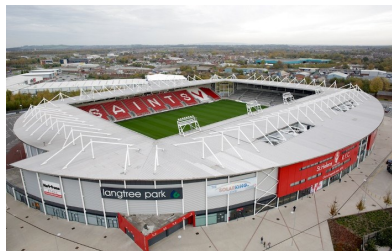
Totally Wicked Stadium (Langtree Park)

7. Where do Saints play their home games?