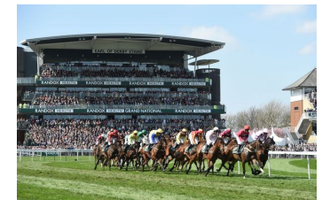
The Grand National

10. Which famous horse race takes place at Aintree on a Saturday in Spring?